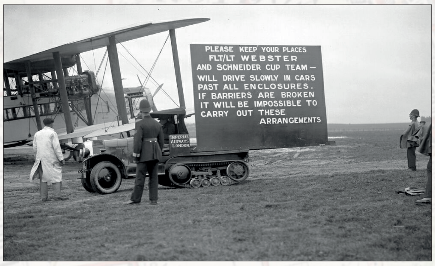
Citroën-Kégresse P4T flat bed. Three engine Handley Page Type W, 25 built, in service from 1921 until 1934