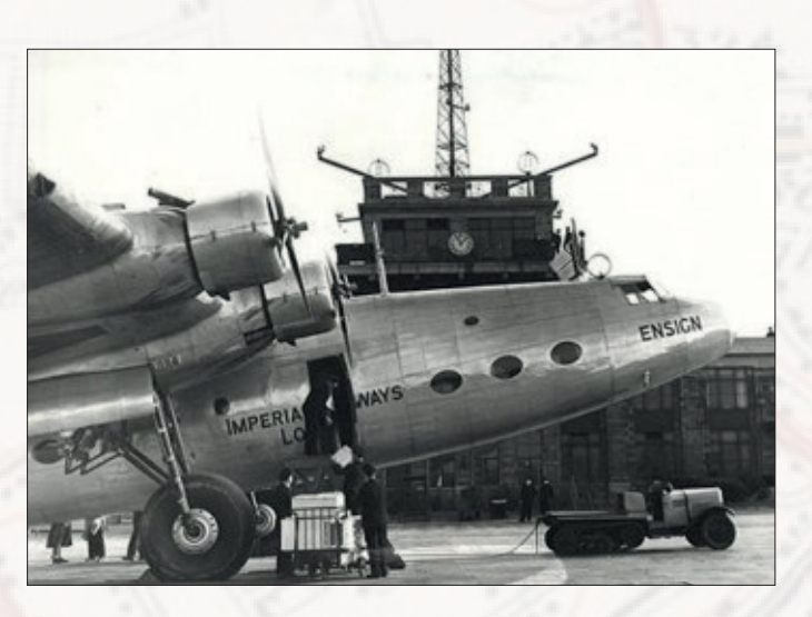
Armstrong Withworth Ensign. The first flight was in 1938. 14 were built. Citroën-Kégresse P10-17 serie with flat bed.