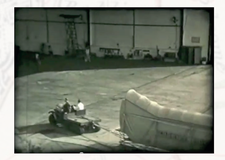
Citroën-Kégresse P10-17 serie