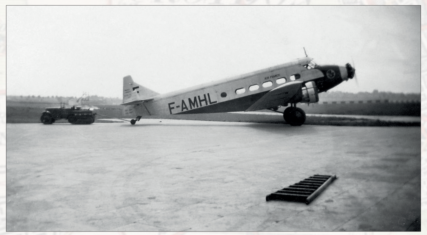
WIBAULT 282 T12 F-AMHL assigned to Air France on May 30, 1933. Nicknamed "Le Fougueux" Citroën-Kégresse P10/17 serie.